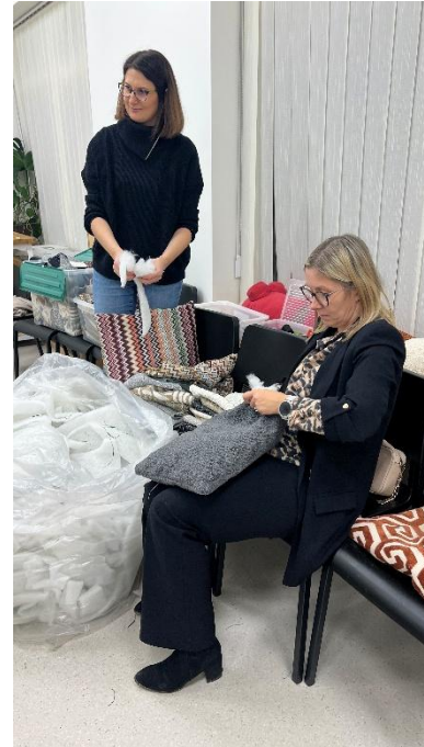
Figure 2 Pillow stuffing.