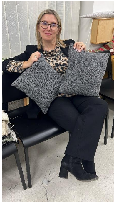
Figure 3 Presentation of a final product.