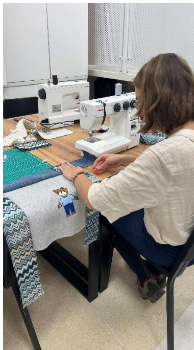
Figure 1 Assembling fabric scraps and sewing them together.

“If the thread breaks, stop the machine and raise your hand.”